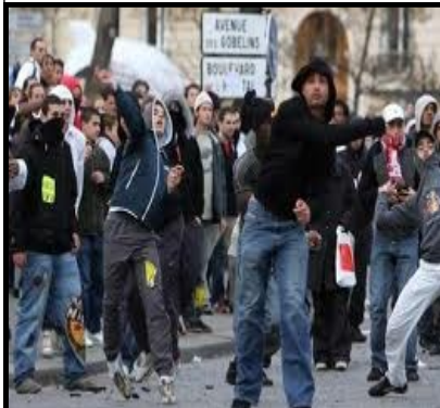
French Students take to the streets

Millions of French workers, Sarkozy calculated that the supported by students, joined protesters would become