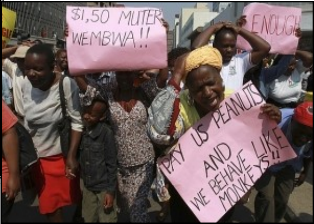
Biti was against salary increments to these civil servants the whole year

Biti promised to resuscitate the Student Loan scheme, to that end he set up $15 million. Never could he have found a more explicit way of privatising tertiary education than what he exposed in his budget presentation. Students might celebrate but they need only question why the government has decided to partner itself with a bank if it was so sympathetic. From experience banks would be very crucial when it comes to following up on creditors (read poor students). And we need not mention commercial bank rates! Page 8