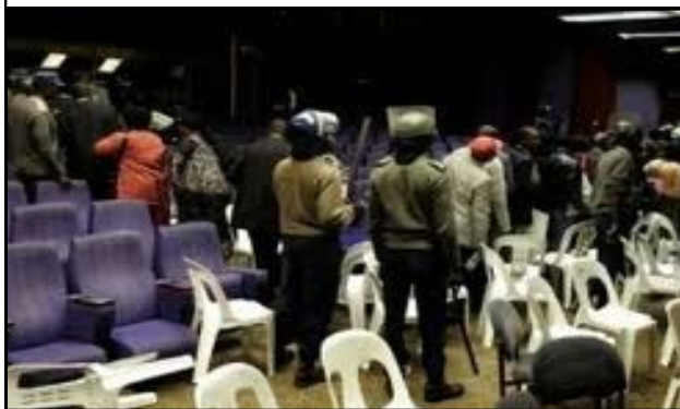
Riot police drive people from a Copac outreach venue

DUF will conclude the final stage with COPAC and use the referendum as the first launch of a bitter fight against neo-liberalism which struggle will go beyond the constitutional making process. Aluta Continua! By Cde Simukai