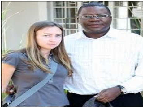
Minister of Finance, Tendai Biti (R)

Frankly, the budget allocations for the crucial social services sector of education and health are far from desirable neither do they meet the crucial needs of these sectors. Education demands in Zimbabwe go beyond $400m, likewise with Health where no provision was made for the availability of Anti-retroviral Drugs. Penga Murwere Penga . But the budget was never funded by people who rob the nation of its wealth, ie, the rich capitalists and pro-imperialist multinationals. The 2010 budget is being funded by the poor while the rich benefits. A clear illustration is provided in the table below: